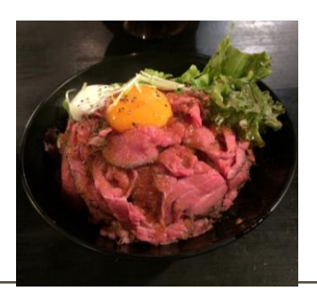
Photo by courtesy of Kisshokichi http://www.koubegyuu.com/shop/kisshokichinankinmachi/image/lunch/steak_burger/01.jpg

This restaurant serves beef steak and other cuisines using Kobe beef. Its Motomachi branch provides Kobe Beef steak hamburger at 1000 yen.