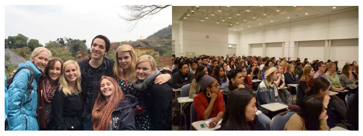
Left: Delegates smiling before Kinkaku-ji in Kyoto.

Surrounded by curtains and carpets of crimson leaves of maple trees and yellow leaves of Ginko trees, some 250 delegates and their faculty members immersed themselves in the Japanese autumn in the ancient capital of Kyoto, and also in the resurrected city of Hiroshima and its neighboring Island of Gods across the Seto Inland Sea: Miyajima. About 100 of NMUN visitors participated in a tour of Kyoto and 150 others in a tour of Hiroshima and Miyajima on Monday, which were put students' together bv the organizing committee at Kobe City University of Foreign Studies (KCUFS). The participants will switch destinations on Tuesday. Each group is accompanied by some 50 student volunteer guides who have been preparing for this occasion since this summer.