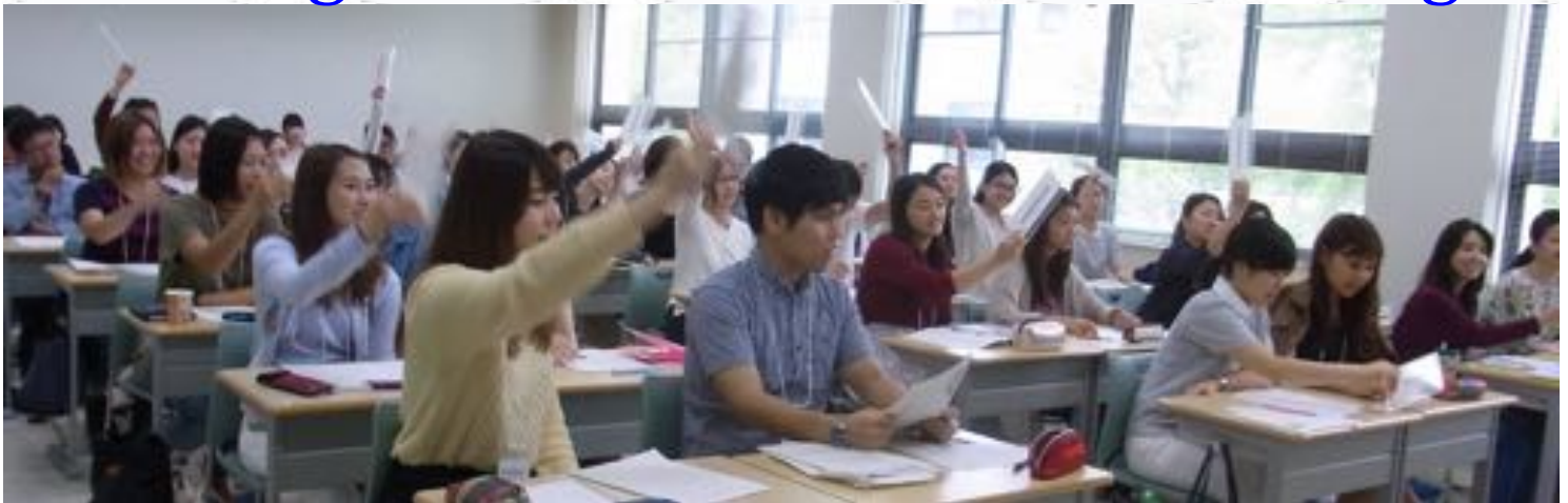
Photo: Delegates compete to raise their placard upon a call for a motion by a chair