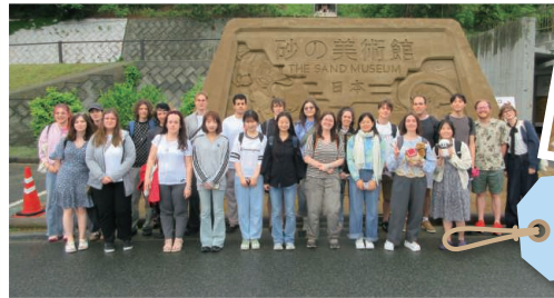
Field Trip to Tottori