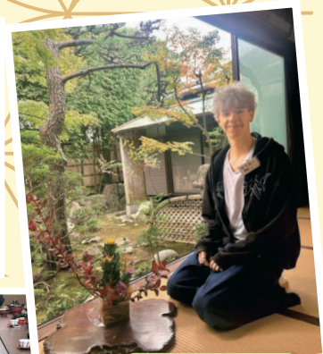
Flower arrangement and Vegetarian lunch